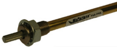
P/N MC454-120 without knob