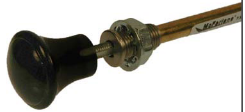
P/N MC454-120 with P/N MC471-060 Knob