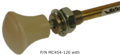
P/N MC454-120 with P/N MC471-052 Knob