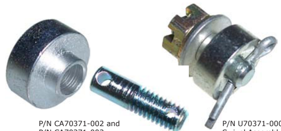
P/N CA70371-002 and P/N CA70371-003 Swivel Fitting and Stud

The U70371-000 replaces Piper P/Ns 70371-000 or 70371-800. These are service kits that include the -002 fitting, the -003 stud as well as an AN320-3 castle shear nut, MS24665-132 cotter pin, and two special sized Piper specific washers.