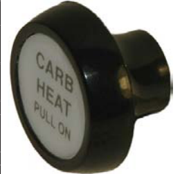
P/N MC471-084 With P/N 6289 Carb Heat Decal (Decal sold separately)

■ Quantity 2 each of knob Cabin Heat (Ivory) is required for these aircraft.