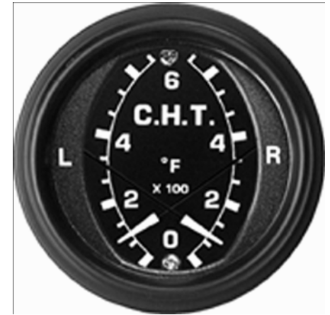
P/N 10-01428 SCALE: 1/1

This document involves CONFIDENTIAL proprietary design rights of HEWITT IND. and all designs, manufacturing, reproduction, use and sale rights regarding same are expressly reserved. It is submitted under a confidential relationship and the recipient agrees to assume custody and control thereof and that proprietary information contained herein shall not be reproduced or transferred to other documents or disclosed to others or used for manufacturing or any other purpose without prior written permission of HEWITT IND.