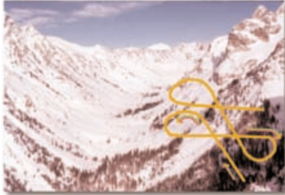
THE FIGURE-8 PATTERN IS USED TO GAIN ALTITUDE WITH THE ASSISTANCE OF OROGRAPHIC LIFT.

Fly along the side of the mountain gaining lift. To stay in the same general area while maneu-