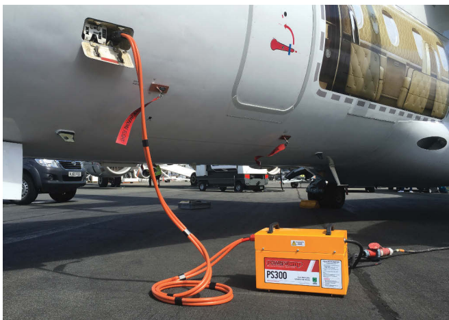
PS300: in operation on a Dornier 328