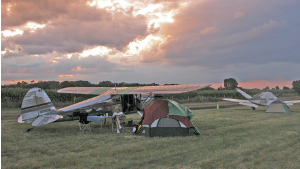
Camping at EAA's AirVenture, Oshkosh, Wisconsin